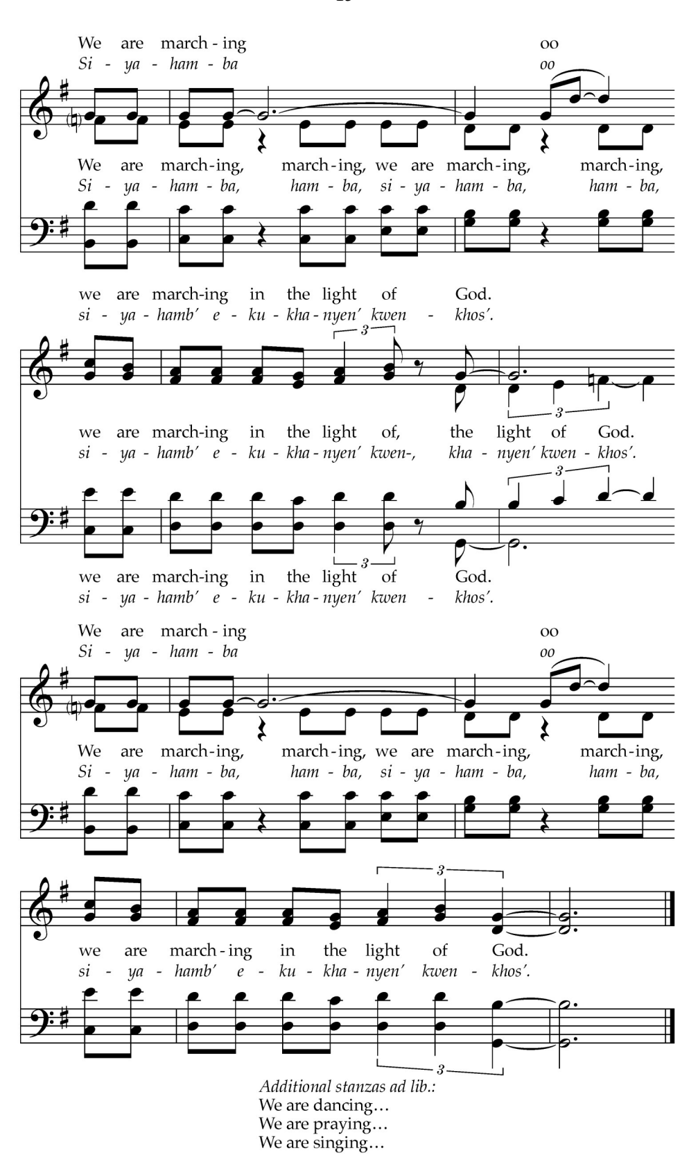
Return to page 4