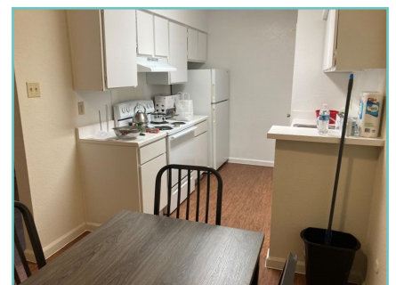
Typical apartment set-up for refugees.

Together let us respond to God's call to welcome the stranger. “Don't mistreat any foreigners who live in your land. Instead, treat them as well as you treat citizens and love them as much as you love yourself.” (Leviticus 19:33–34a)