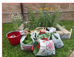
By Cathy Patterson

As we begin to return to regular worship on the St. Philip campus, consider going around back and checking out the garden. You’ll find lots of vegetables, a few weeds, and also a small patch of flowers and milkweed plants. The garden is a living demonstration of God’s good creation, and it also gives our congregation an opportunity to share our bounty with neighbors in need.