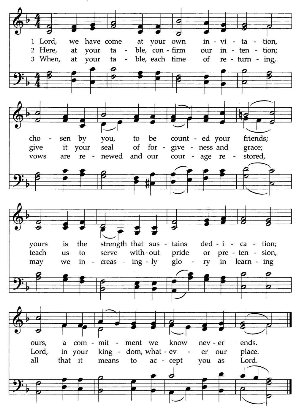
St. Augustine spoke of eucharist as "the repeatable part of baptism," and this hymn reminds us that each time we share in the Lord's Supper we are renewing our baptismal vows. The text is set to a tune that dates to the transition between plainchant and modern tonalities.

TEXT: Fred Pratt Green, 1977, alt. MUSIC: Paris Antiphoner, 1681; harm. La Feillée's Méthode du plain-chant, 1808 Text © 1979 Hope Publishing Company