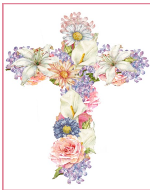
Flower cross by Molly Boren.

CrossWords is a summer sermon series that begins Jul. 2 . For eight weeks we will consider different New Testament perspectives on the cross upon which Jesus died and through which we are called to newness of life. We invite you to contribute art that we can use for bulletin covers during the series. We are especially interested in renderings of the large cross on the front wall of the sanctuary. Drawings, paintings, photographs, and other media are welcome. Your contributions can be sent to lorrie@saintphilip.net or dropped by the church office.