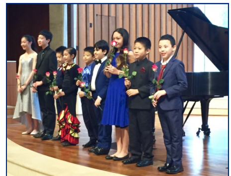
Child Piano Prodigy Performers on March 24.