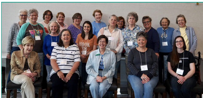
2019 Presbyterian Women's Retreat