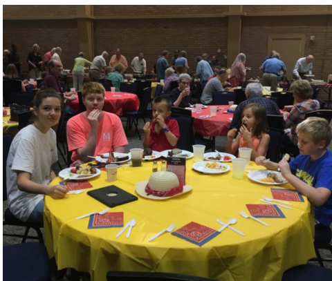
Fellowship activities are for all ages!