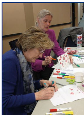
Pictures in this edition are from Second Sunday activities on February 12.

CHILDREN'S CHAPEL In the Children's Chapel, our young disciples learn the whos, whats, wheres, whens and whys of worship in the chapel, while also praying, seeing and hearing God's word at an age-appropriate level. Children return to join the congregation in the first few pews on the lectern side of the church for the last hymn. This will resume on February 26 and continues every 2nd and 4th Sunday during the 11 o'clock service.